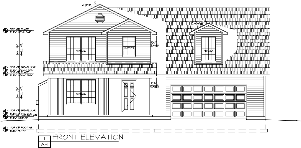
1 FRONT ELEVATION A-1